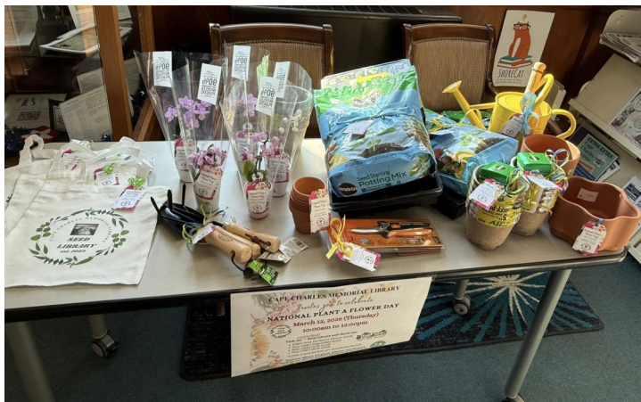
CAPE CHARLES MEMORIAL LIBRARY NATIONAL PLANT A FLOWER DAY March 12, 2026 (Virtual) 10:00am to 12:00pm

Families gathered in the library to enjoy the story time on the big screen, and the fun didn't stop there! We had fun activities like making colorful Truffula trees with yarn, as well as a raffle for great prizes including Seuss tote bags and a copy of Mychal Threets's new release. As the festivities wrapped up, each child left with a good bag full of Seussical surprises, including a brand new copy of One Fish, Two Fish, Red Fish, Blue Fish .