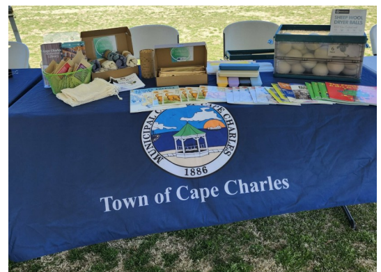
Town of Cape Charles 1886

We also had a wonderful time at Cape Charles Day, our annual community cleanup and picnic, where CCML set up a table to share information about our services and upcoming spring and summer programs. We promoted litter prevention and recycling through our Department of Environment Quality grant, giving away eco-friendly items such as reusable cotton grocery bags, dryer balls, bamboo toothbrushes and non-plastic pens. Stay tuned for more giveaways in April for Earth Day!