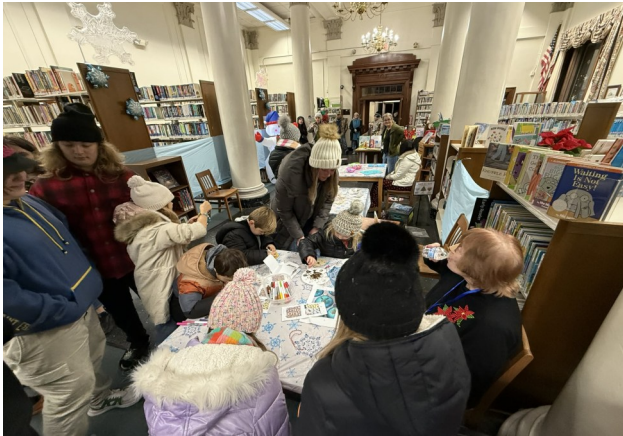
Full house at CCML

With ongoing construction, snowy weather, and holidays, the Cape Charles Memorial Library had a brief month of being open to the public. The CCML staff and I want to extend our thanks for the understanding and patience of our patrons. We're also grateful to Northampton Free Library and ESVA Regional Library for their support during our recent closure.