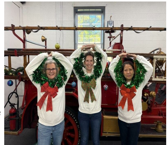
Happy New Year from the staff at Cape Charles Memorial Library

Wishing you a joyful and healthy new year ahead!