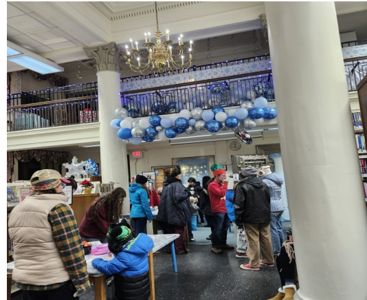
Festive Friday 2025 at Cape Charles Memorial Library

Despite December being a shorter month, we still managed to create a festive and lively atmosphere for our patrons to explore the stacks, have documents notarized, or take advantage of our free Wi-Fi. Additionally, the CCML staff and I took part in Festive Fridays, a beloved annual event in Cape Charles, providing a cozy space for families and children to enjoy holiday crafts. Over two Friday evenings, we welcomed more than 500 visitors to the library's festivities! This achievement wouldn't have been possible without the support of our Library Board,