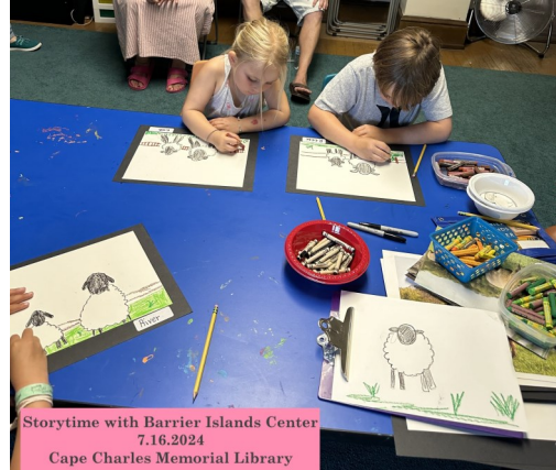
Storytime with Barrier Islands Center 7.16.2024 Cape Charles Memorial Library