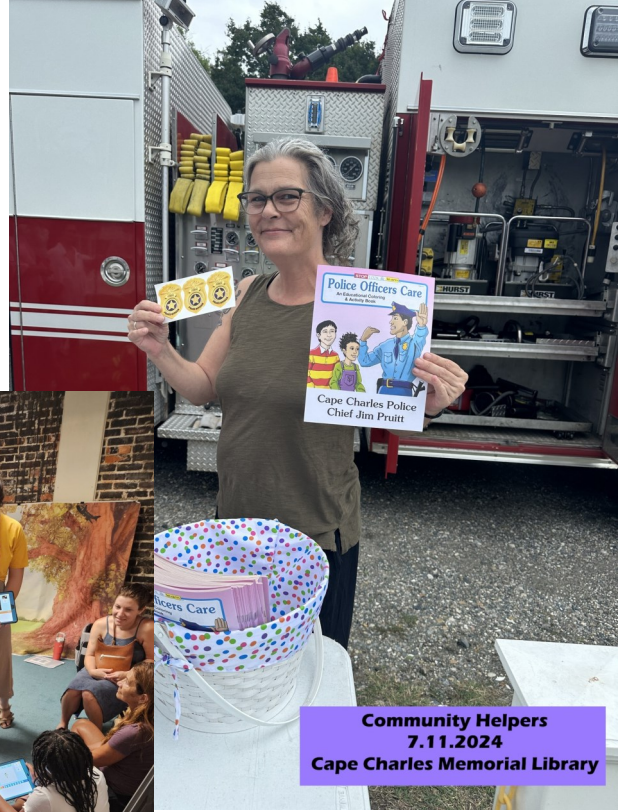
Community Helpers 7.11.2024 Cape Charles Memorial Library