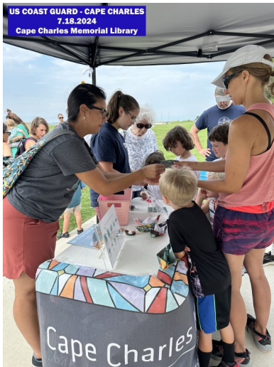
US COAST GUARD - CAPE CHARLES 7.18.2024 Cape Charles Memorial Library