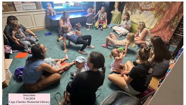
Storytime 7.16.2024 Cape Charles Memorial Library