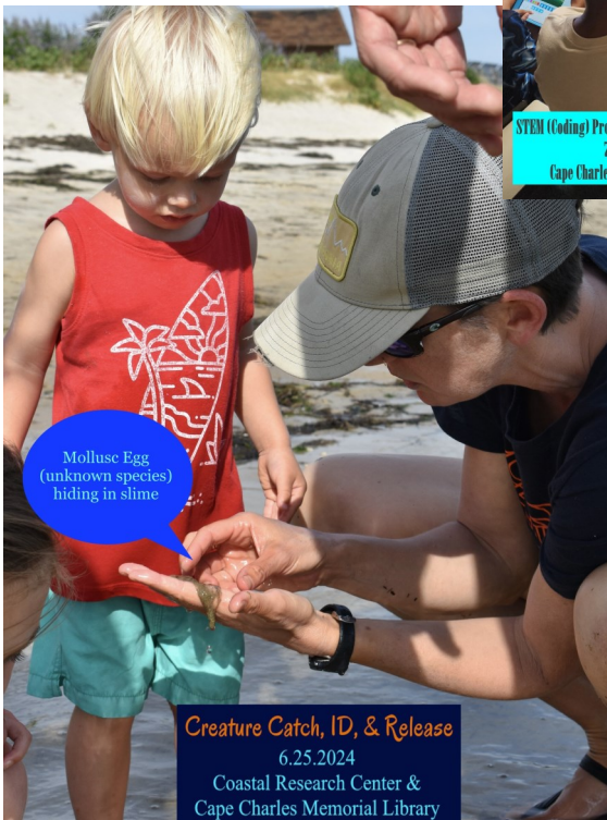
Mollusc Egg (unknown species) hiding in slime