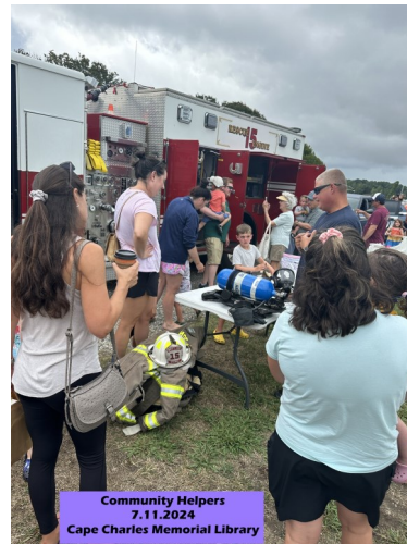
Community Helpers 7.11.2024 Cape Charles Memorial Library