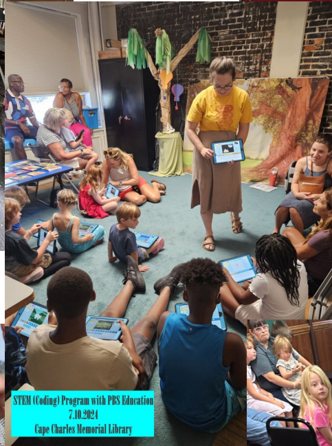
STEM (Coding) Program with PBS Education 7.10.2024 Cape Charles Memorial Library