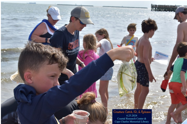
Creature Catch, ID, & Release 6.25.2024 Coastal Research Center & Cape Charles Memorial Library