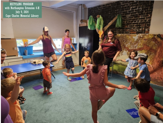
RECYCLING PROGRAM with Northampton Extension 4-H July 9, 2024 Cape Charles Memorial Library

Cape Charles Memorial Library set an all-time attendance record during the month of July 2024 with over 4,100 visitors and more than 850 attendees to our summer programs! Staff has done an incredible job creating and leading our programs, with lots of smiles and laughter!