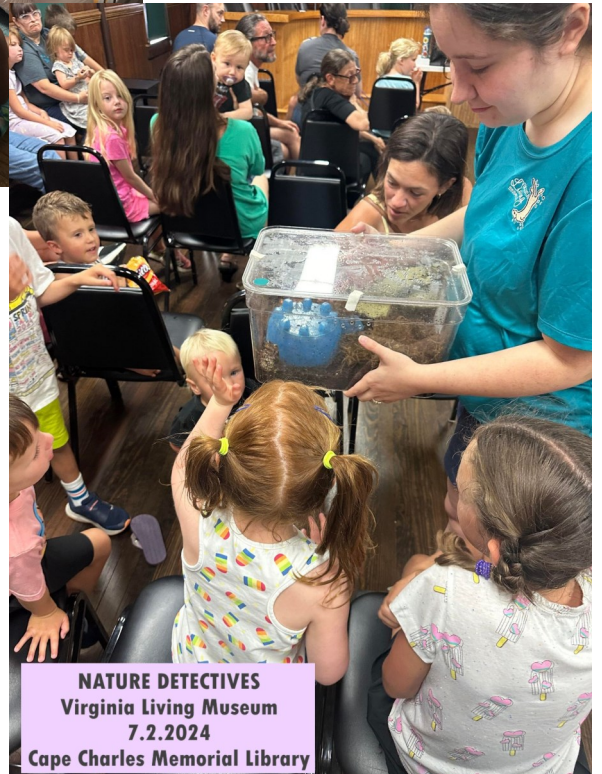
NATURE DETECTIVES Virginia Living Museum 7.2.2024 Cape Charles Memorial Library