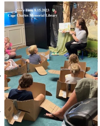
Story Time 8.15.2023 Cape Charles Memorial Library