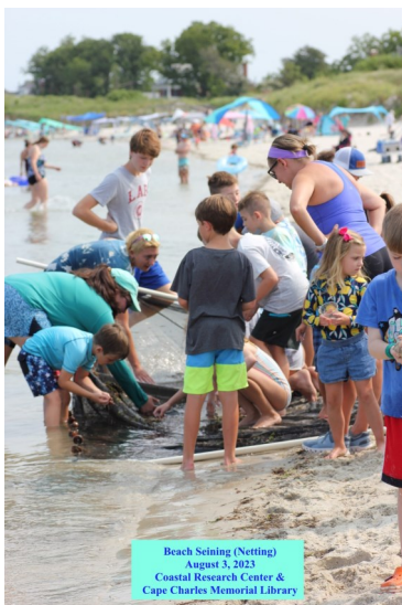
Beach Seining (Netting) August 3, 2023 Coastal Research Center & Cape Charles Memorial Library