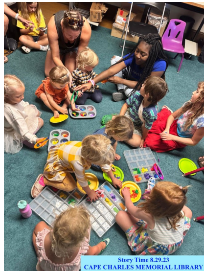
Story Time 8.29.23 CAPE CHARLES MEMORIAL LIBRARY