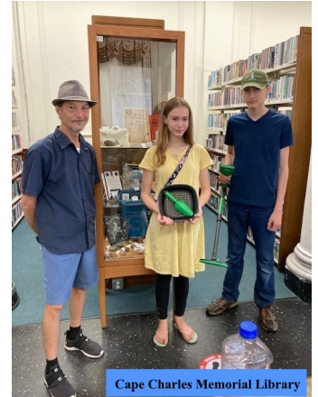
Cape Charles Memorial Library

We would like to thank our Friends of Cape Charles Memorial Library group for their ongoing support. Over the summer they have held monthly book sales to support the library and recently financed 3 new computers for our computer lab.