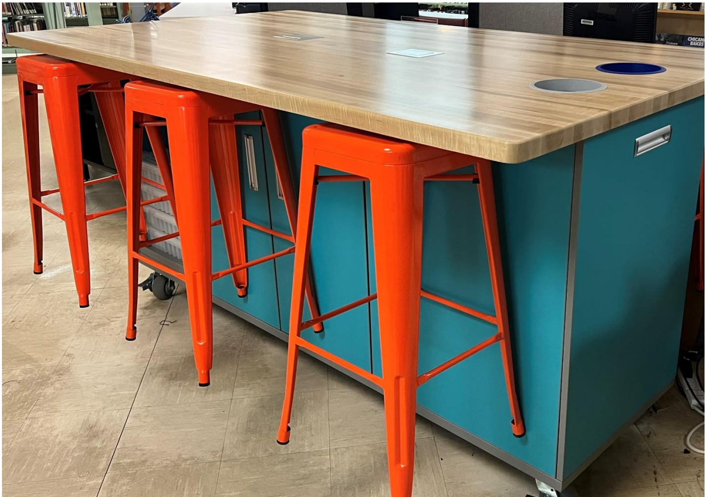
HAVE A SEAT AT THE TABLE OF INFORMATION