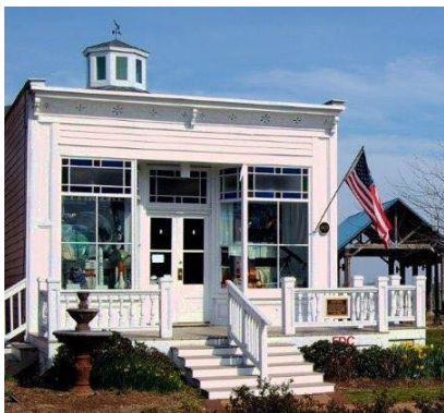
Chincoteague Island Library