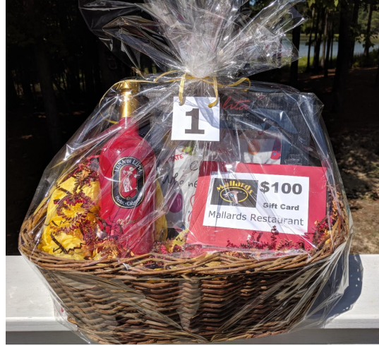
Mallard's gift basket donation for the library's fundraiser.