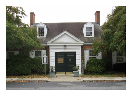
Eastern Shore Public Library