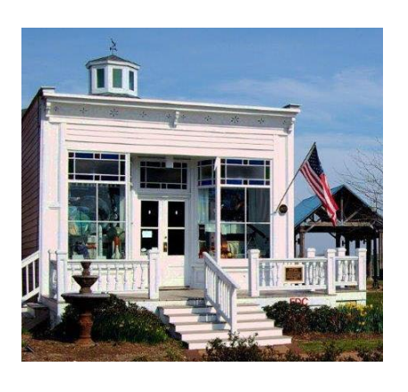
Chincoteague Island Library