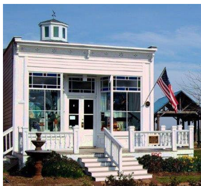
Chincoteague Island Library