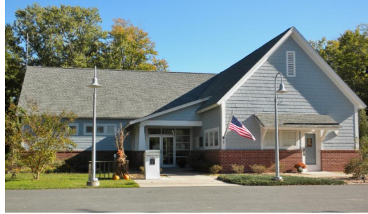
Northampton Free Library