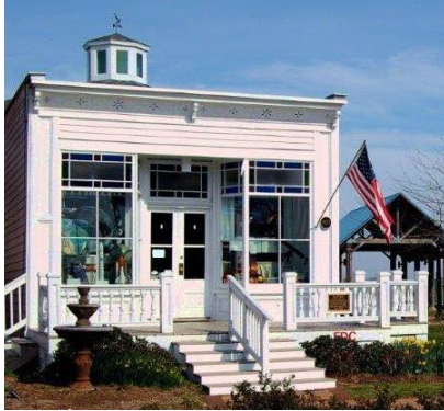
Chincoteague Island Library