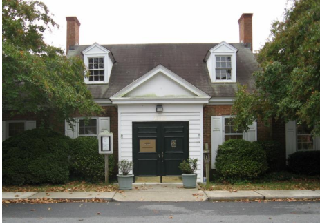
Eastern Shore Public Library