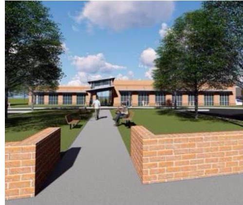
Architect's depiction of the new library in Parksley.