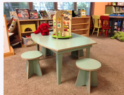
New activity table in the ESPL children's room from the Friends and eFab Local

Children's story time, book clubs, adult coloring, author lectures and more! Looking for something fun to do? Check us out!