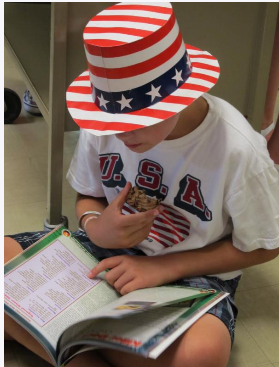
A young customer at the Firecracker Book Sale enjoying his purchase.