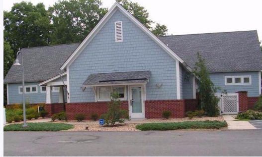
Northampton Free Library