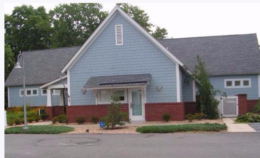
Northampton Free Library