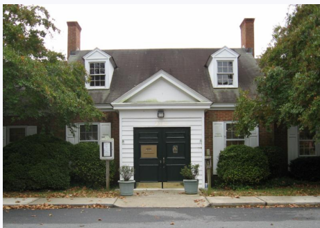
Eastern Shore Public Library