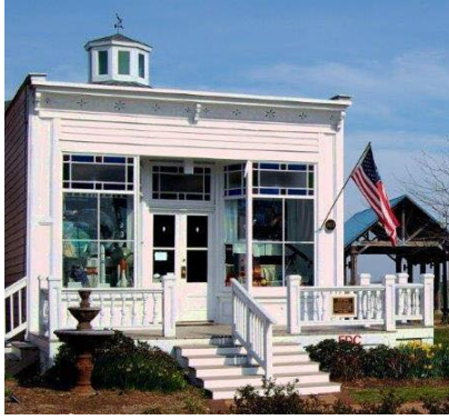
Chincoteague Island Library